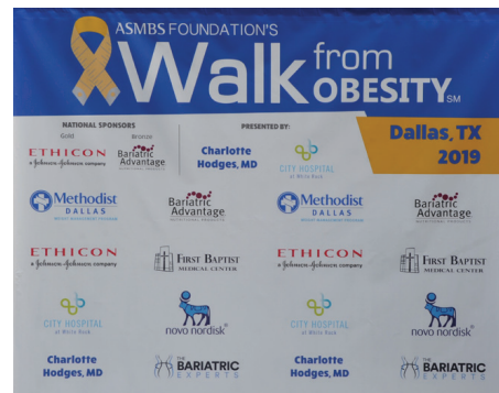
Step and Repeat Banner Example,