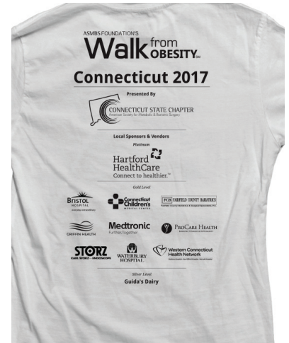
Back of T-shirt Example

PRESENTING SPONSORS. The Presenting Sponsor of your local Walk has already committed sponsorship dollars, as well as countless volunteer hours to plan your local Walk from Obesity. This sponsor and the ASMBS Foundation will work together to create a great event for your community.