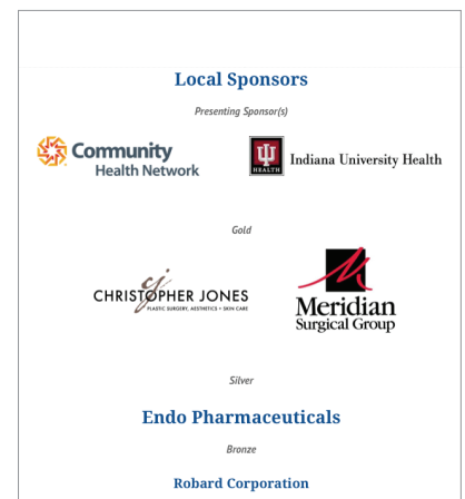
Registration Page Example

Individuals that support the participants with a donation or financial pledge are also an integral part in this inspiring event.